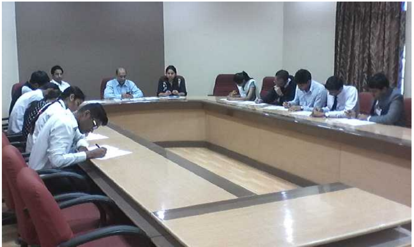
Kirloskar Pneumatic Group discussion – Kirloskar Group Pool Campus 2014-15