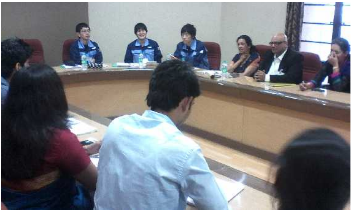
Komori Japan visit – Dt. 15/01/2015