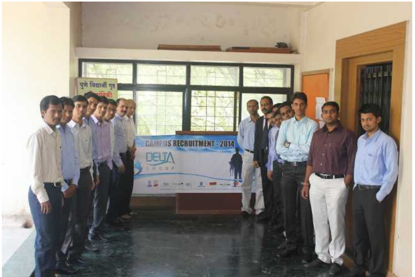
Delta Press, Dubai - Campus Recruitment 2014-15