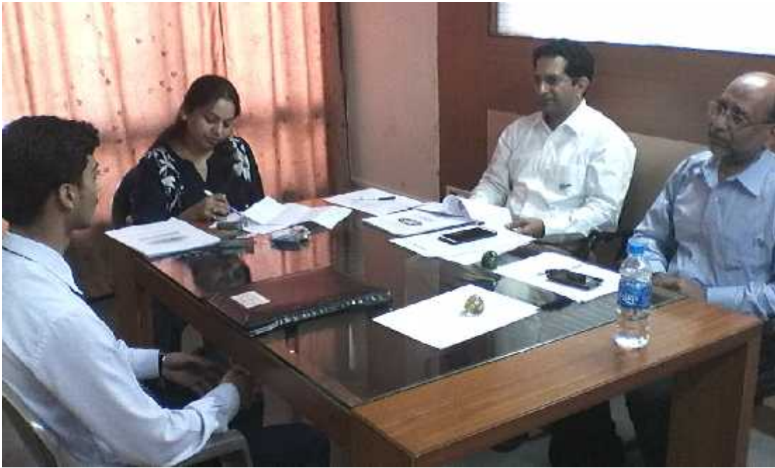
Kirloskar Pneumatic Interviews – Kirloskar Group pool Campus 2014-15