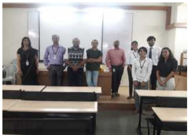
Campus Rceruitment Photos