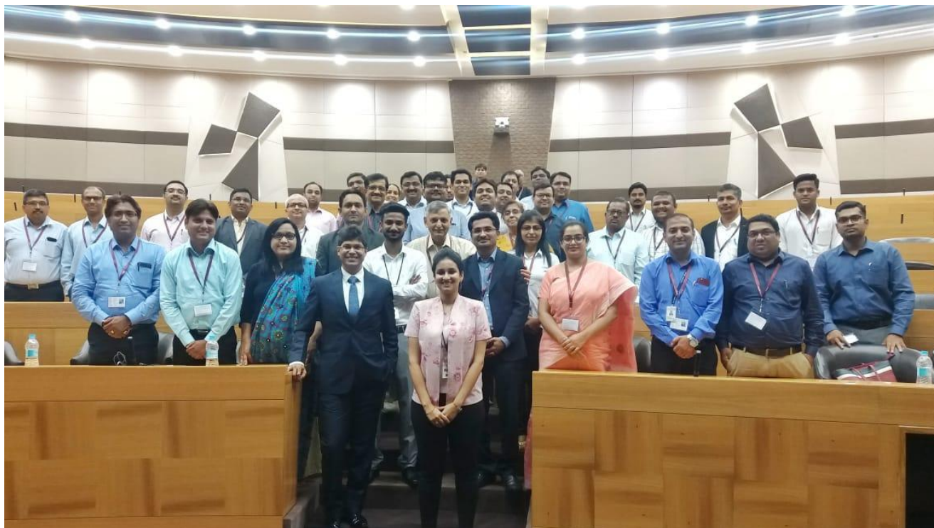
Infosys Meet – Infosys, Hinjewadi Office Dt. 28 th May 2019