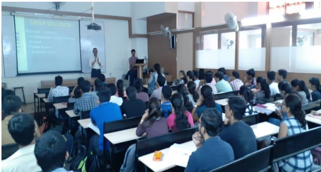
TIME Session on Preparation for Campus Recruitment Dt.- 15/7/19