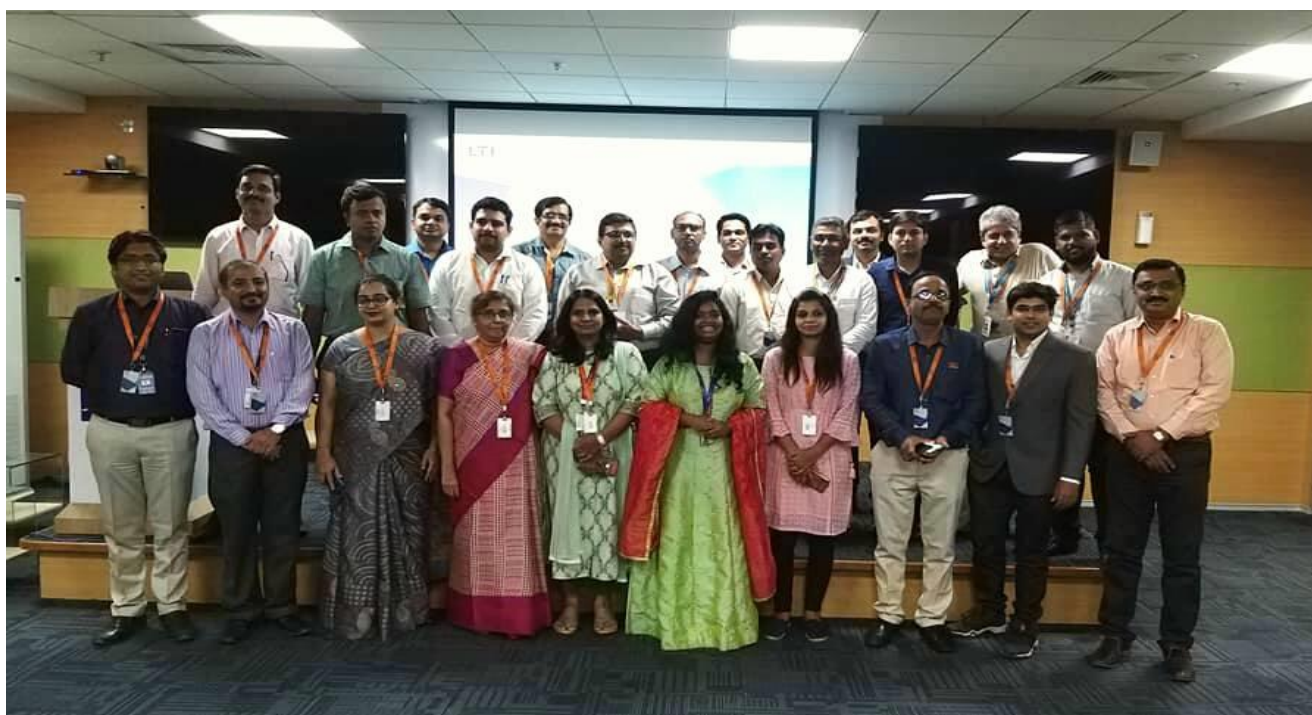
Larsen and Toubro Infotech Meet dt. 25 th June 2019