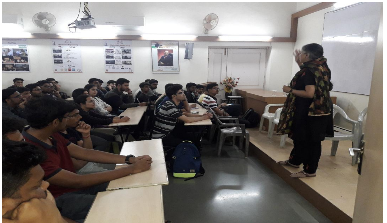
IBS Session on GD,PI dt. 17/1/2020