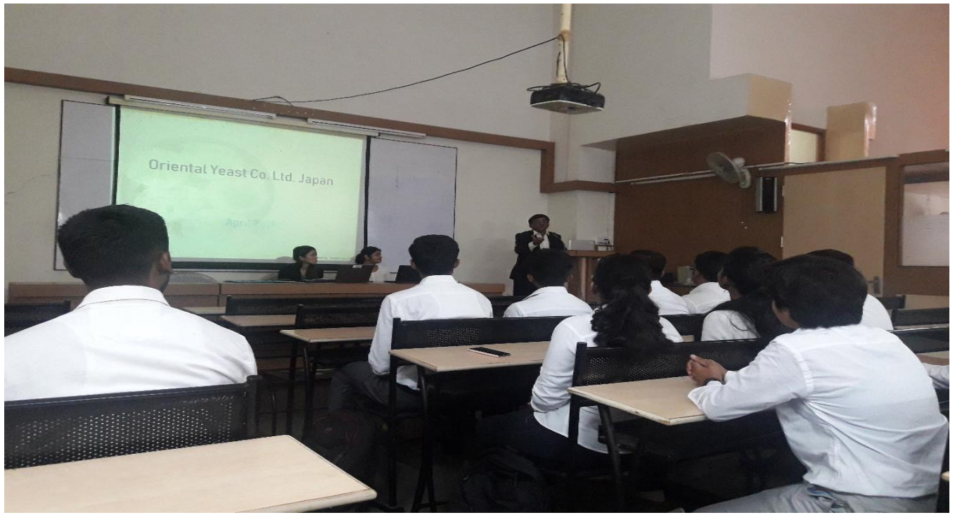
Oriental Yeast Company, Japan Pre-placement Talk dt. 2/7/19