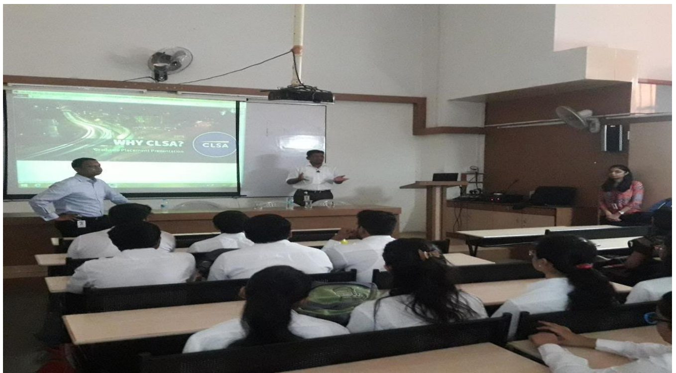
CLSA Pre-placement Talk dt. 23/9/19