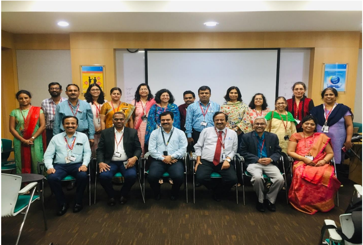
TCS leadership Programme on 9 th September 2019, Monday