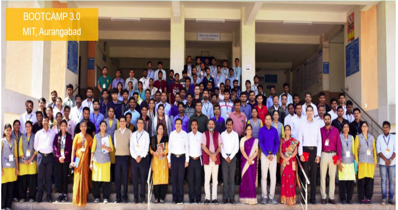
IIT Bombay Team & PVG's COET Regional Coordinators with hosts & participants