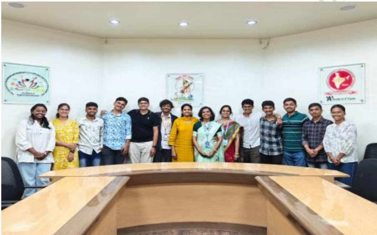
Organizing Team (PVG COET)