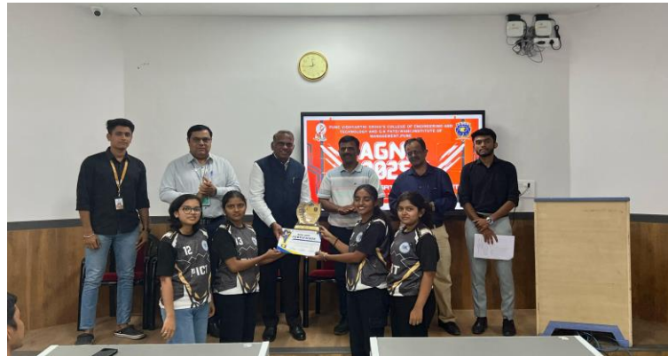
Prize Distribution of P.V.G. Agni 2025 Tournament