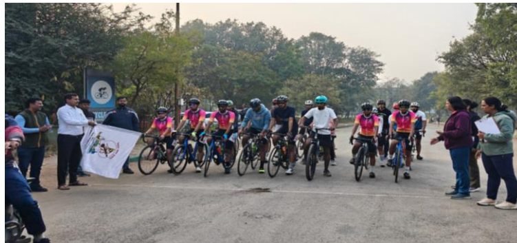
Flag off of SPPU PCZSC inter-college cycling competition, at Balewadi Stadium.