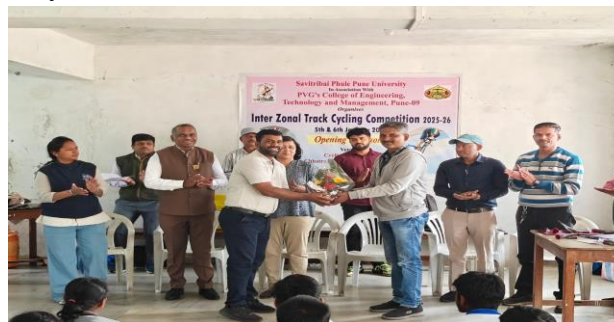
Inauguration of SPPU inter-zonal Track Cycling competition, at Balewadi Stadium.